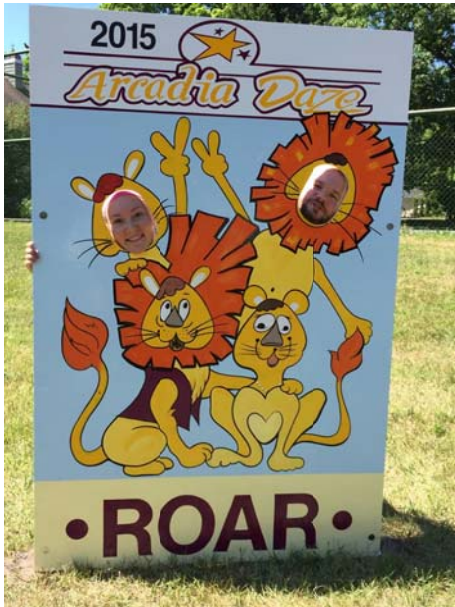
Arcadia Lion Photo Shoot at the recent Arcadia Daze Festival!