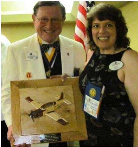
PIP Sid Scruggs Gift (The plane not the 1 st Lady) (Made by PDG Dan Gibbons)