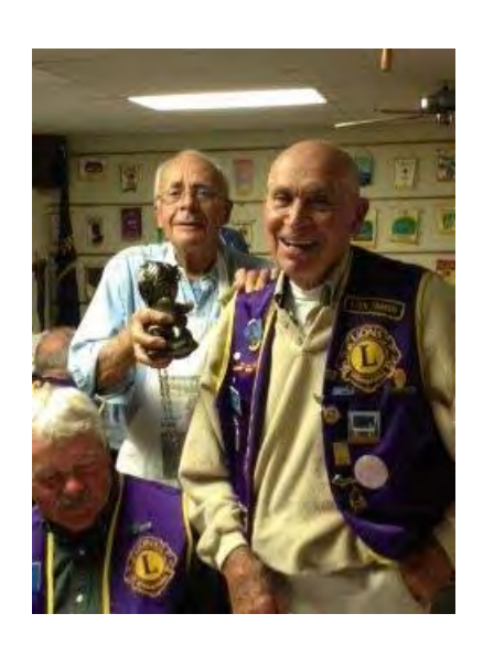
"Did You Know"