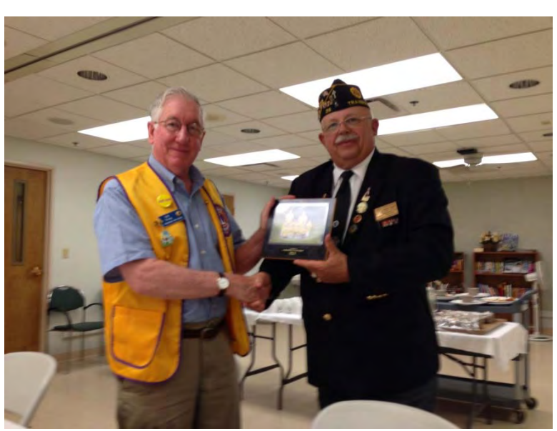
Traverse City Lions

The Stanton Lions Club completed a very active month by sponsoring a very successful third annual golf outing at the Links of Bowen Lake on July 19. They then Organized and completed their first annual 5k run held during Stanton's Old Fashion Days celebration on August 10 and had a successful chicken dinner on the same day serving over 200 dinners. These were all successful fund raisers allowing the club to continue serving the community.