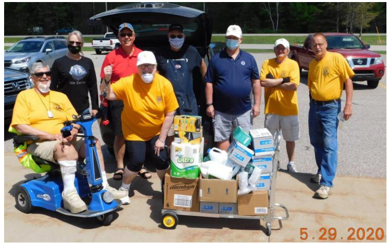
Lions making delivery at Meridian Elementary School (another distribution site).

Midland Lions had their first board meeting via Zoom on May 18, 2020. We have not been able to have any regular meetings. We had to cancel our big Hole in One fundraiser, but we hope to have our annual Chicken BBQ fundraiser with some modifications. The second half of our White Cane fundraiser was canceled as well.