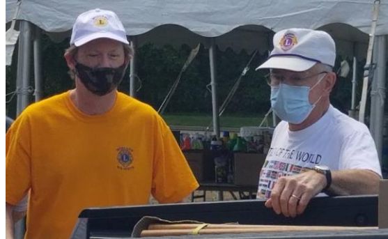
Midland Lions making delivery at Midland High School, one of the distribution sites. It was reported that these items were exactly what they wanted.

Supplies purchased through ACE included special masks, chemical gloves of various sizes, splash goggles, bleach, concrobium for mold, mops, sponges, trash bags, and buckets. This is just the first phase. We will monitor needs and adapt to what is needed in the next phase. Thanks to all the Lions who helped including our DG Jackie Glazier.