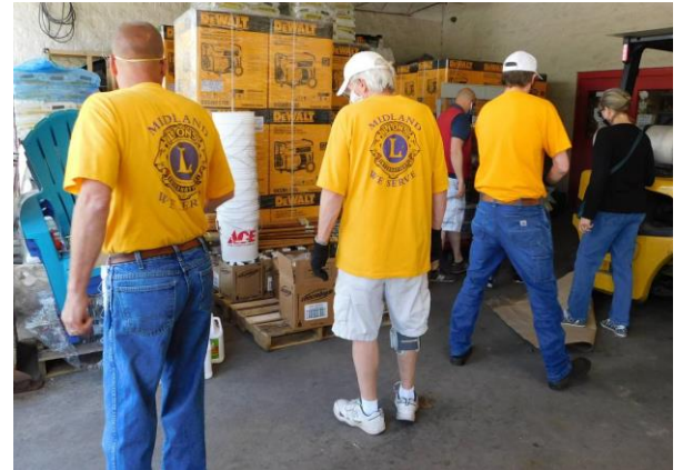
Lions loading vehicles at ACE Hardware with cleaning supplies, masks, and gloves.