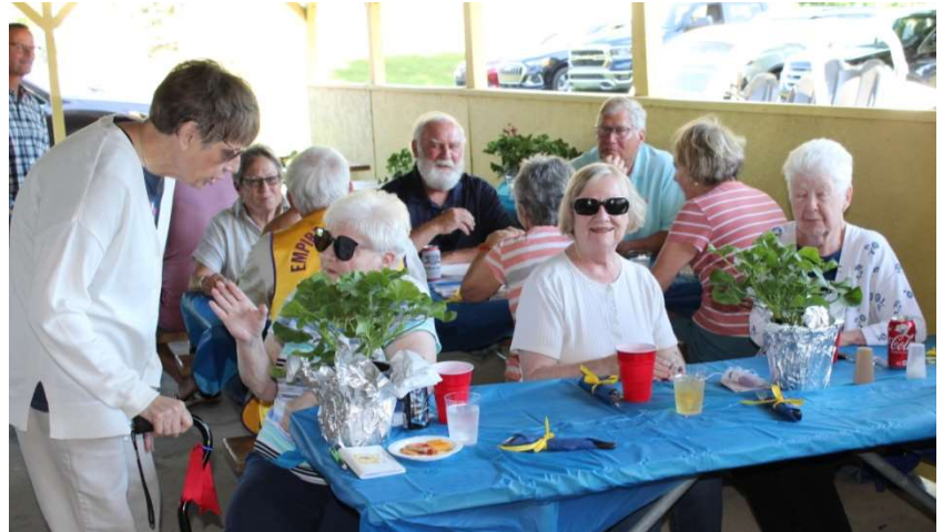
Guests at the Charter dinner.