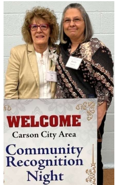
Top Academic Seniors