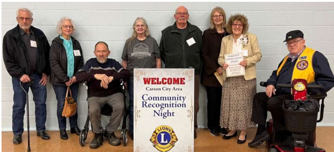
Carson City Historical Society