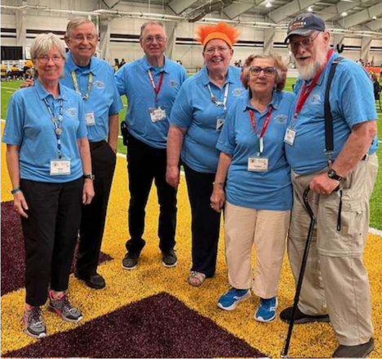
District 11E1 Lions volunteering at Opening Eyes on May 30 & 31.